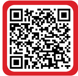
Exhibit Hours: 10am-3pm Both Days